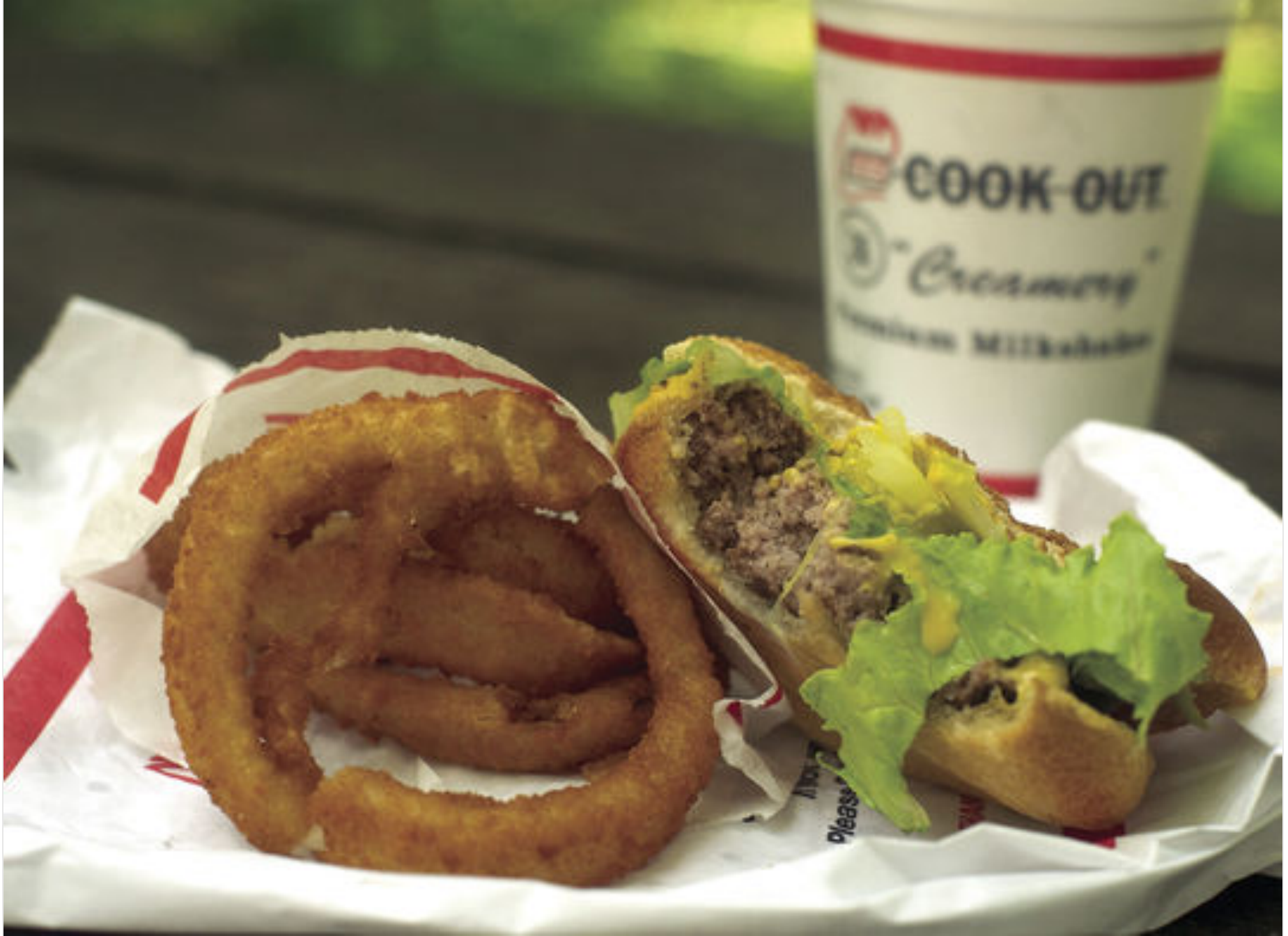
Cook Out to open in July in Spotsylvania